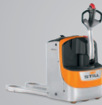
2,200 kg Li-Ion INSIDE