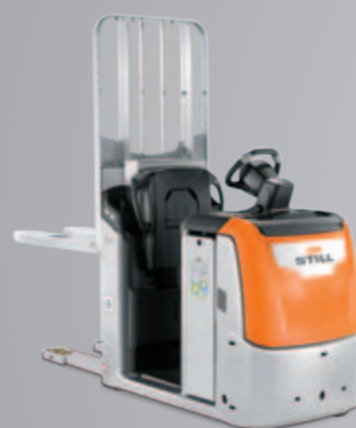
1,200 kg Li-Ion INSIDE