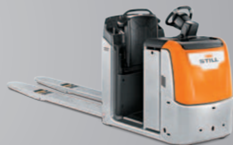
2,500 kg Li-Ion INSIDE