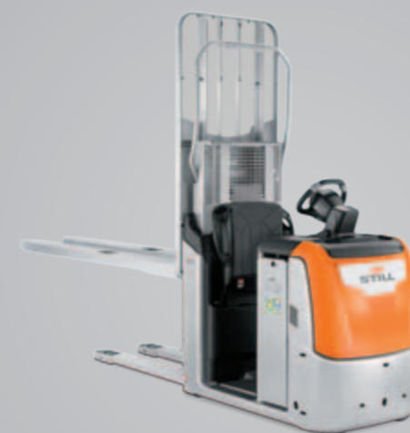
1,600 kg Li-Ion INSIDE