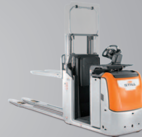
2,000 kg Li-Ion INSIDE