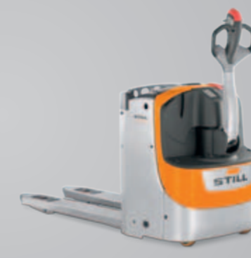
2,000 kg Li-Ion INSIDE