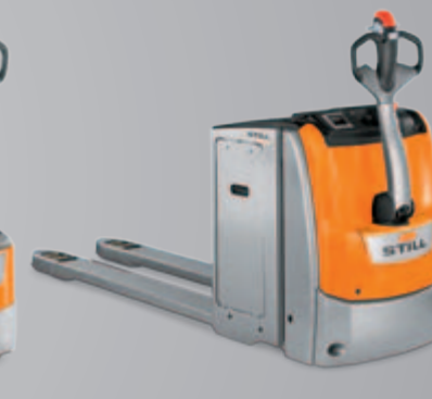
3,000 kg Li-Ion INSIDE