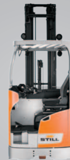
D FM-X with cold-store cabin