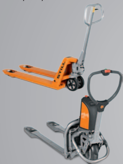
3,000 kg/500 kg