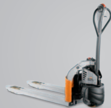
1,200 kg Li-Ion INSIDE