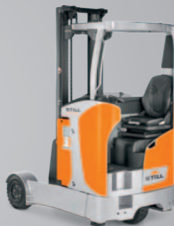
A FM-X SE 20